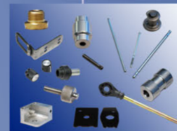
Components & Inserts